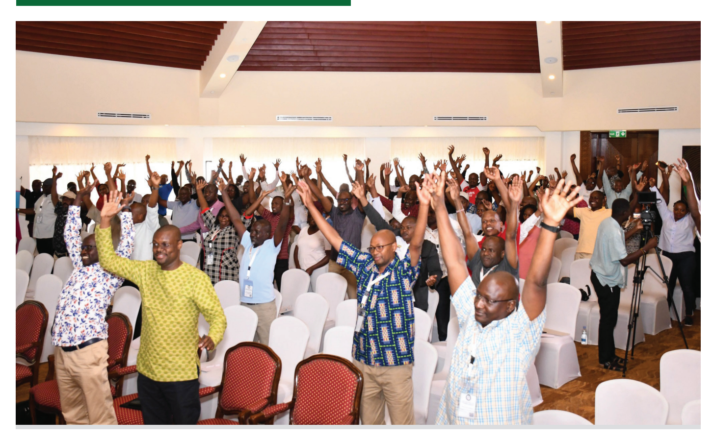
SCM Professionals during a past workshop

The customized in-house training programmes are designed to equip practitioners and stakeholders with practical skills and knowledge to carry out procurement within the confines of prevailing procurement law and guidelines, while promoting professionalism and best practice in SCM practice. This helps to increase overall organizational effectiveness through the application of tested procurement and supply chain management concepts.