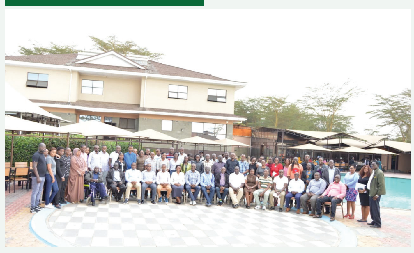
Participants following through a session during the procurement training for Committees, CECs, and User Departments on 27th September 2024 in Naivasha

The Procurement Training for Committees, CECs, and User Departments successfully concluded today, 27th September 2024, in Naivasha after an intensive five-day session aimed at strengthening procurement processes across counties. Attendance comprised of County Executive Committee Members (CECs), procurement committees, and other key stakeholders, focused on building capacity to ensure more efficient, transparent, and ethical procurement practices within county governments and public institutions.